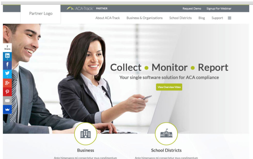
Figure 1: aca-track.org Home Page

ACA-Track Partners have the option of subscribing to and deploying a co-branded version of aca-track.com for their marketing purposes. The web site can be readily “branded” using your company logo and contact information, along with selective opportunities for customizing content and engagement or call to action (CTA) mechanisms. (See Figure 1.) The website can be accessed by a link from your existing web site or promoted as a singular site using a unique url, for example: partnername.aca-track.org